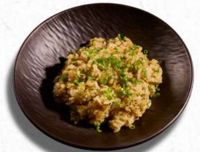
Garlic Fried Rice