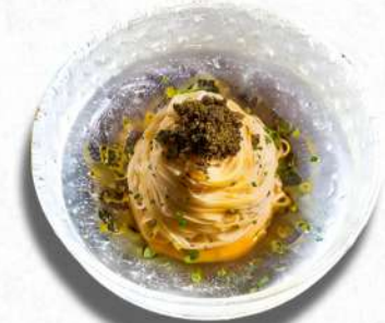
Truffle Cold Somen