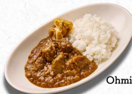
Ohmi Wagyu Curry Rice